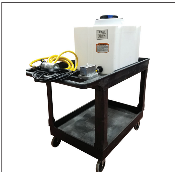
TU-WPP Optional Water Pump Package comes with 25 gallon tank and convenient cart.