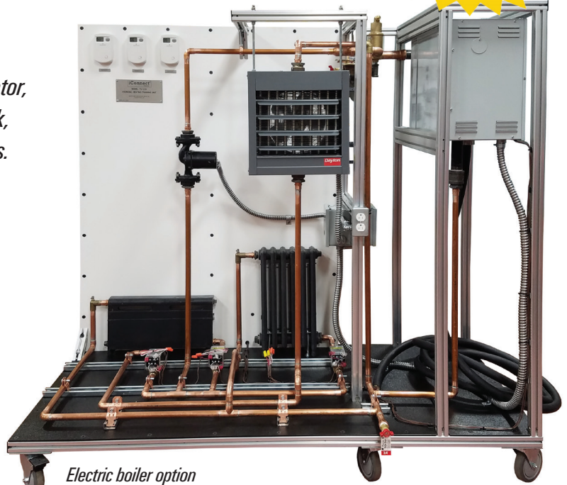
Electric boiler option