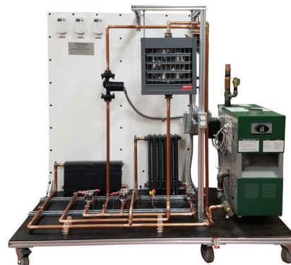
Gas boiler option